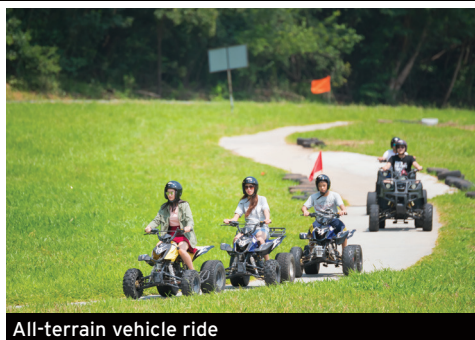
All-terrain vehicle ride