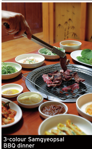
3-colour Samgyeopsal BBQ dinner